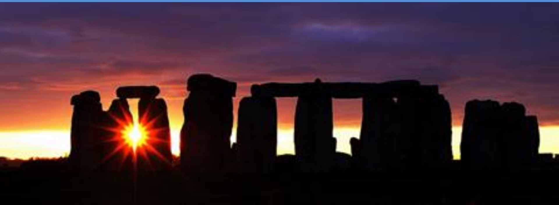
Photo courtesy of Peter G Trimming (@flickr.com) – granted under creative commons license - attribution.

The stones are positioned very carefully to align with sunrise at midsummer and sunset at midwinter at opposite ends of the circle.