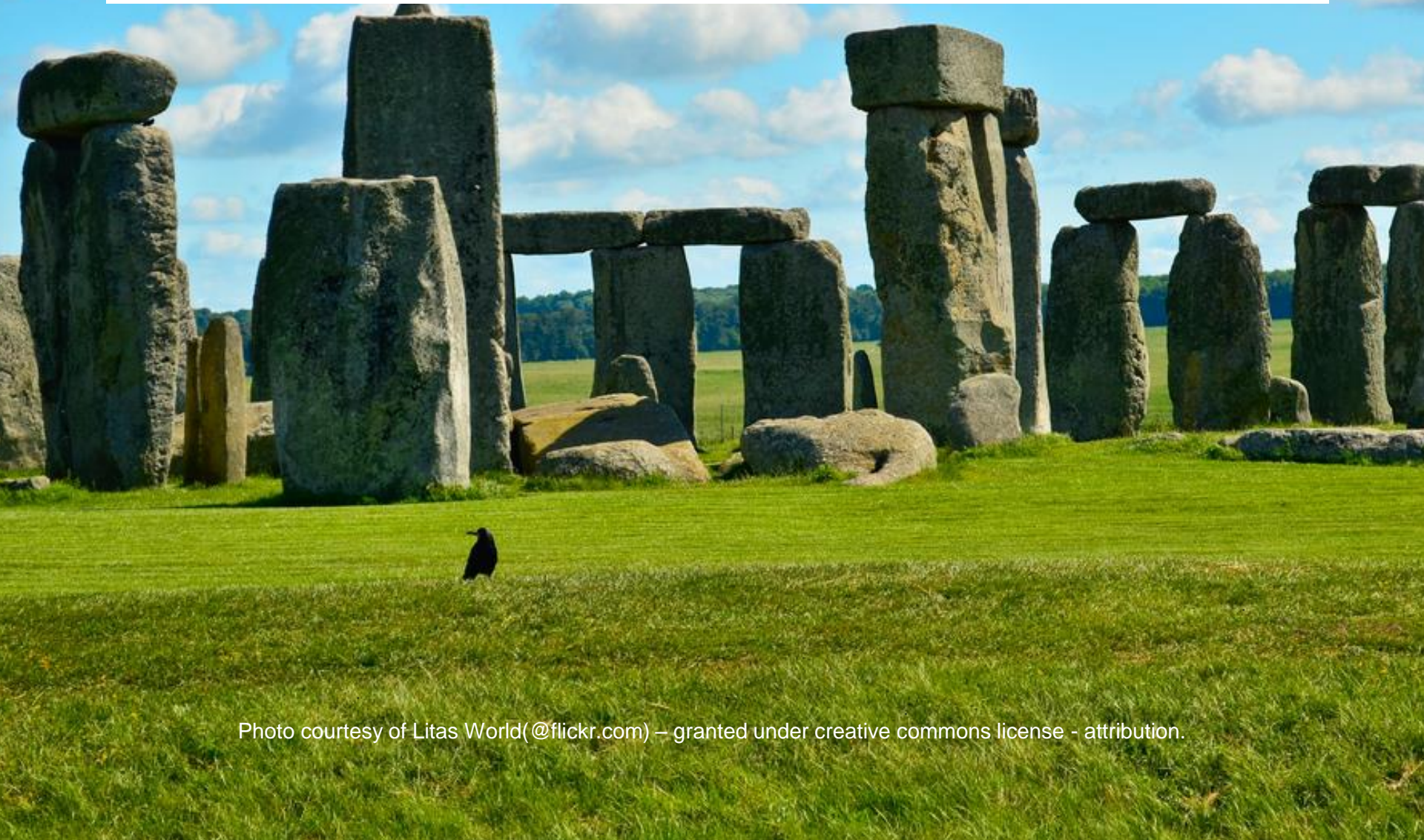
Photo courtesy of Litas World( @flickr.com ) – granted under creative commons license - attribution.

It has been estimated that the three phases of construction could have taken more than thirty million hours of labour!!!!