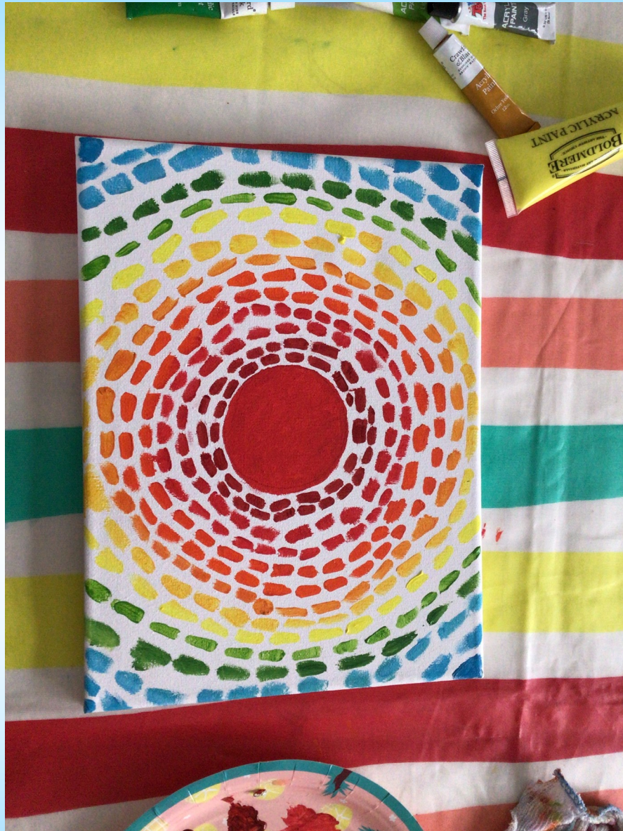
Evie's Alma Woodsey Art Well done Evie!